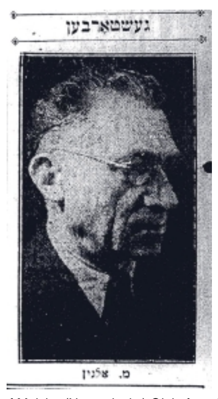
Confirmed photo of Moishe (Novaminsky) Olgin from his 1939 obituary