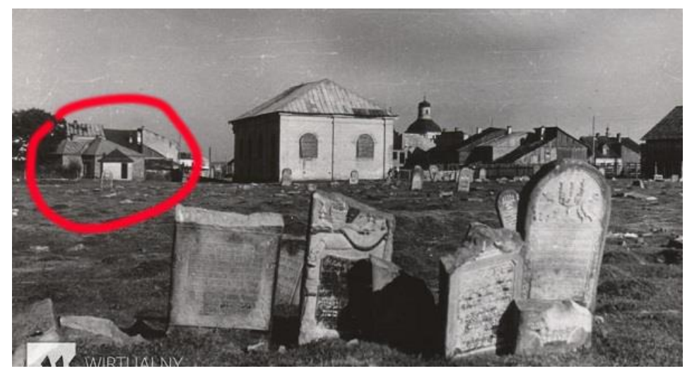
The building circled in red thought to have belonged to the Chevra Kadisha

There is a building standing to the right of the synagogue which may have belonged to the Chevra Kadisha for purposes of conducting the tahara (ritual purification) of the dead before burial. Such a building is known to have existed in that location and can even be seen in the post-war photograph of the cemetery.