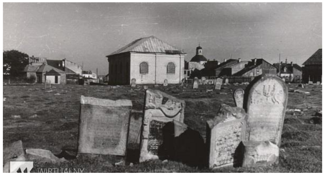
A photo appearing in many archives showing the remnants of the cemetery sometime after the war. The back of the synagogue can be seen in the background, giving some indication of the cemetery's size and location relative to the synagogue.

Klimontow's Jewish cemetery was located directly behind the synagogue, an unusual arrangement for Jewish communities of the time. Most of the gravestones were removed by the Germans and probably used as building and paving material. After the war many graves were vandalized by the locals as they rummaged for the gold and silver that was assumed to be buried with their Jewish neighbors. In 1967, under Communist rule, the municipality appropriated the area, stripped it of its remaining gravestones and built a public school on a portion of the grounds. The fate of the removed gravestones is unknown, though some are known to be held by various locals.