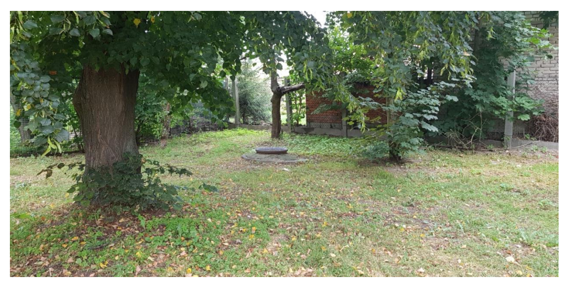
A reservoir well on the grounds of the cemetery

In portions of the cemetery there are signs of drainage pipes having been laid underground. At various locations one can see the lids of reservoir wells, some of them weighted down with gravestone fragments so as to prevent children from lifting them. The evidence of this underground work almost surely points to the possibility of widespread grave desecration.