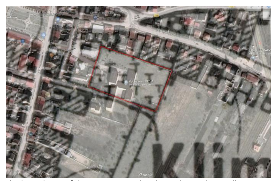
The boundaries of the cemetery outlined in red over the satellite image

With the advent of satellite photos available through the Internet, the task may be easily accomplished by way of superimposing the war map over a satellite photo from Google Earth, using the adjoining roads as anchoring coordinates.