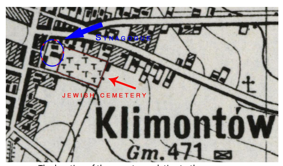
The location of the cemetery relative to the synagogue