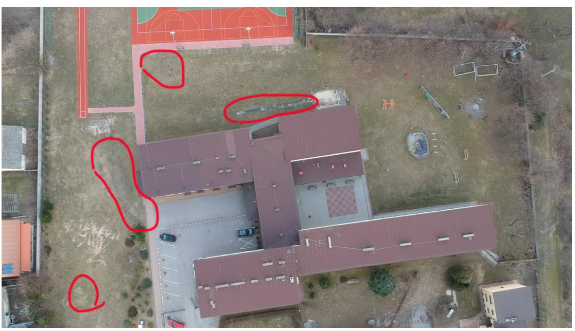
Signs of underground digging for laying pipes as seen from an aerial photograph

While touring the school I met with its principal, but she refused to discuss the cemetery with me, claiming that all inquiries should be directed to the municipality. The officials at the municipality refused to talk with us as well. Finally, after much imploring, we were told to contact FODZ (the Foundation for the Preservation of Jewish Heritage in Poland), as they were now the custodians of communal Jewish property and would have all the documentation.