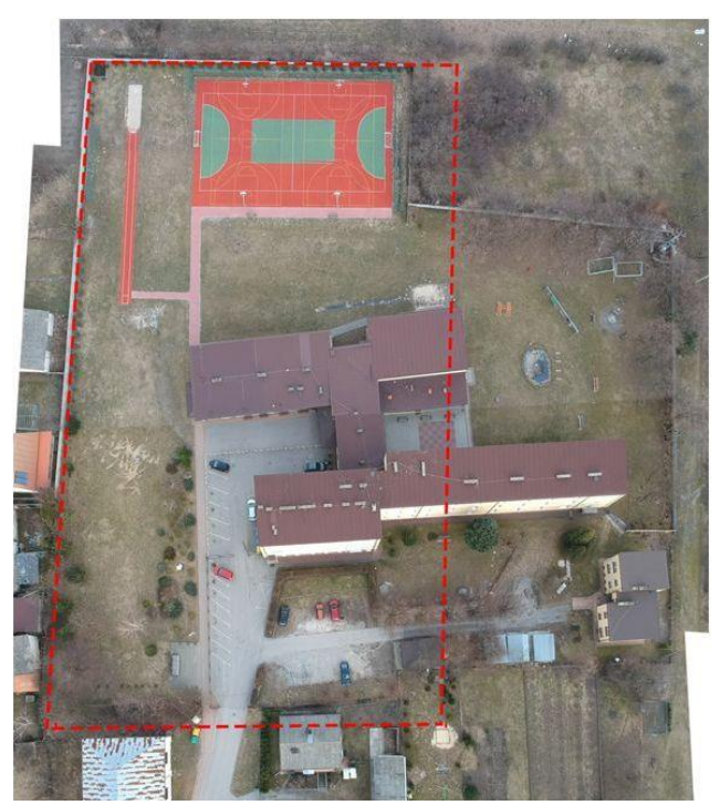
An aerial view of the school facilities standing on the cemetery

A survey of the area establishes that the northern and southern boundaries are about 132 meters long while the eastern and western boundaries are about 80 meters long. That would indicate a 425 meter-long perimeter and an area of 10,600 square meters, 40% of which appears to have been built upon by the school (not including the soccer and basketball fields). Considering that the average grave takes up 2 square meters, there would be space in this area for up to at least 5,000 graves, rendering the record of 4,000 burials wholly plausible.