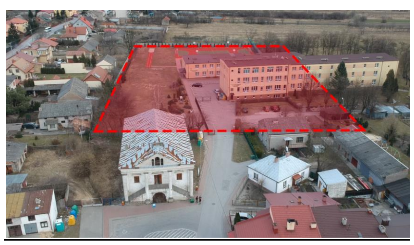
A view from a different angle