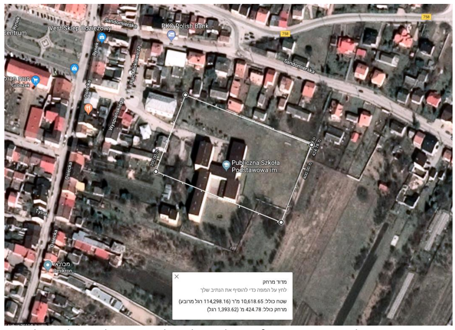
Those boundaries outlined in white after removing the war map